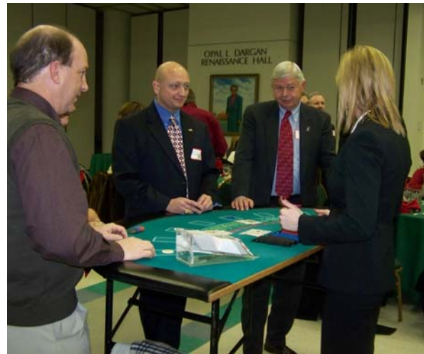
Casino Night Gaming