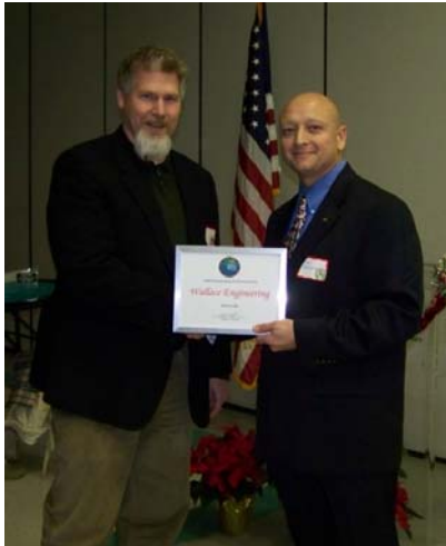
Wallace Engineering, Outstanding Sustaining Firm