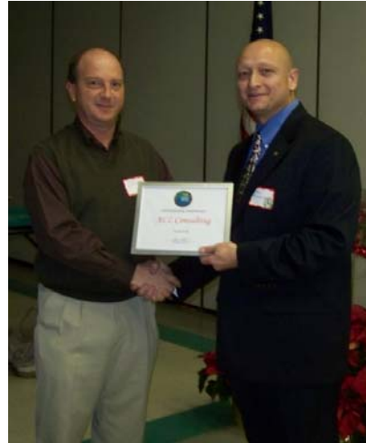
ALL Consulting, Outstanding Small Business