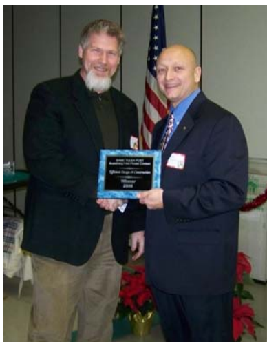
Wallace Engineering, Winner of Poster Contest for Efficient Design and Construction